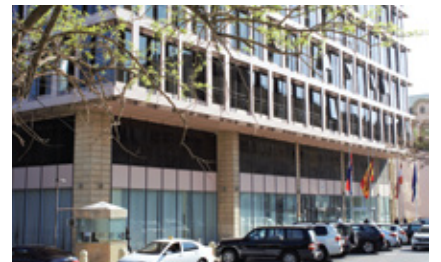
P. 12 INTERVIEW WITH SOCIETE GENERALE