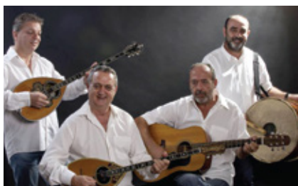
P. 8 THE SECOND GREEK LANDMARK EXPERIENCE